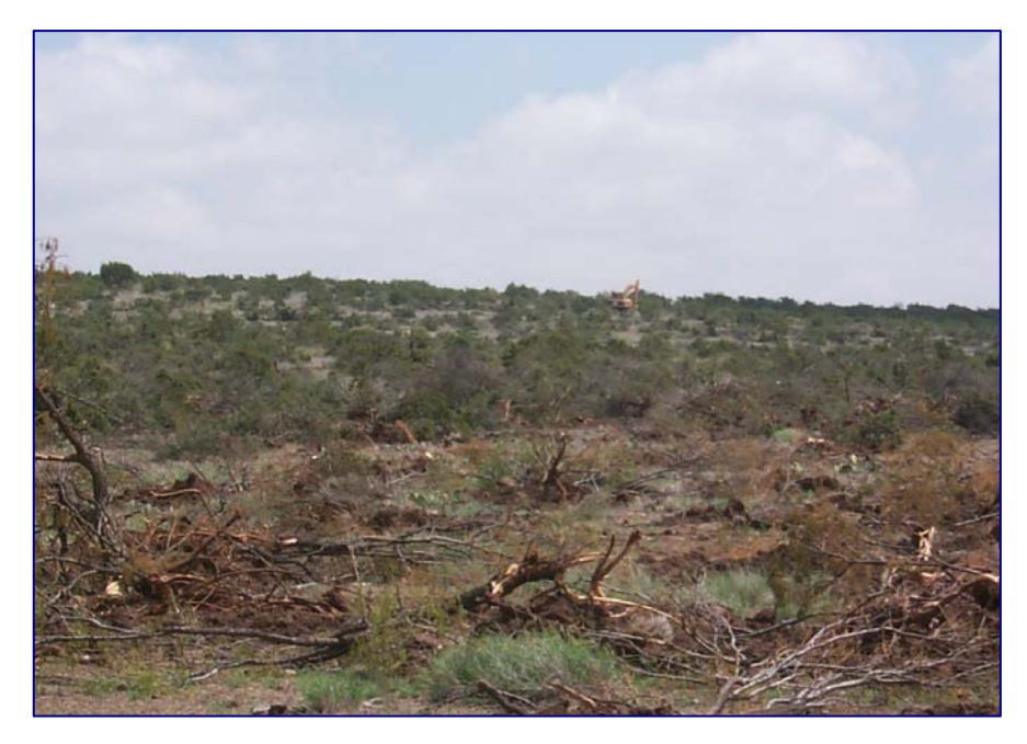
Mechanical-removed brush near San Angelo

Because of large year-to-year variation in rainfall and spatial variation geology, soils, in brush cover. and land ownership, obtaining definitive measurements of the of effects brush control on streamflows and aquifer recharge is