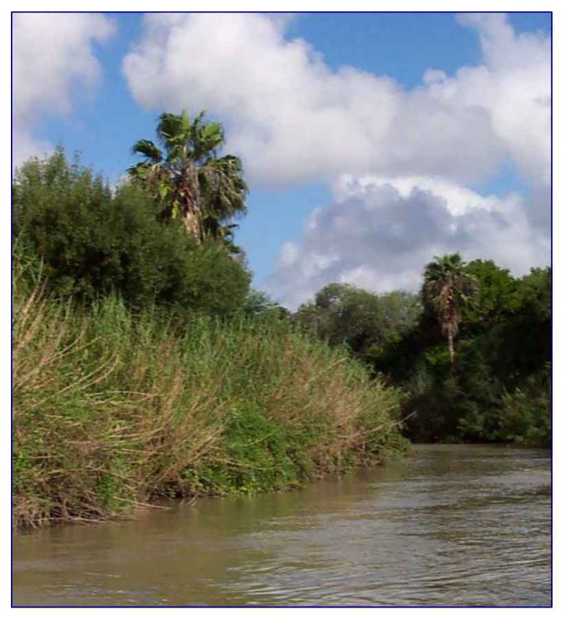
Giant Cane along the Arroyo Colorado in the Lower Rio Grande Valley