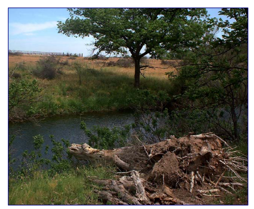
Sterling Creek in the North Concho River watershed, once dried, is a perennial-flowing creek after brush control (May 2005).

Wilcox et al. (2006b) reviewed available literature and concluded that brush control is most likely to increase water yield in three key areas: 1) riparian areas with accessible groundwater and dominated by invasive riparian species such as salt cedar, 2) upland landscapes with woody species such as juniper and oak on soils that