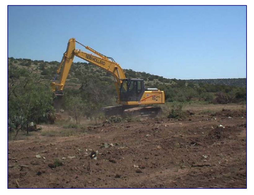
Grubber removing mesquite

These results are consistent with the results of two reports from the Seco Creek watershed in Medina County. Dugas et al. (1998) found that for the first two years after juniper was cleared, total evapotranspiration was about 4.3 inches per year less on the cleared site than on the uncleared site. This finding illustrates how reductions in interception and vegetative water use can alter the hydrology of a treated site. In the third year after brush clearing, Dugas et al. (1998) found that both sites produced approximately equal amounts of evapotranspiration, probably due to much greater growth of perennial grasses as well as compensatory growth of other woody plants on the cleared site. The authors suggest that