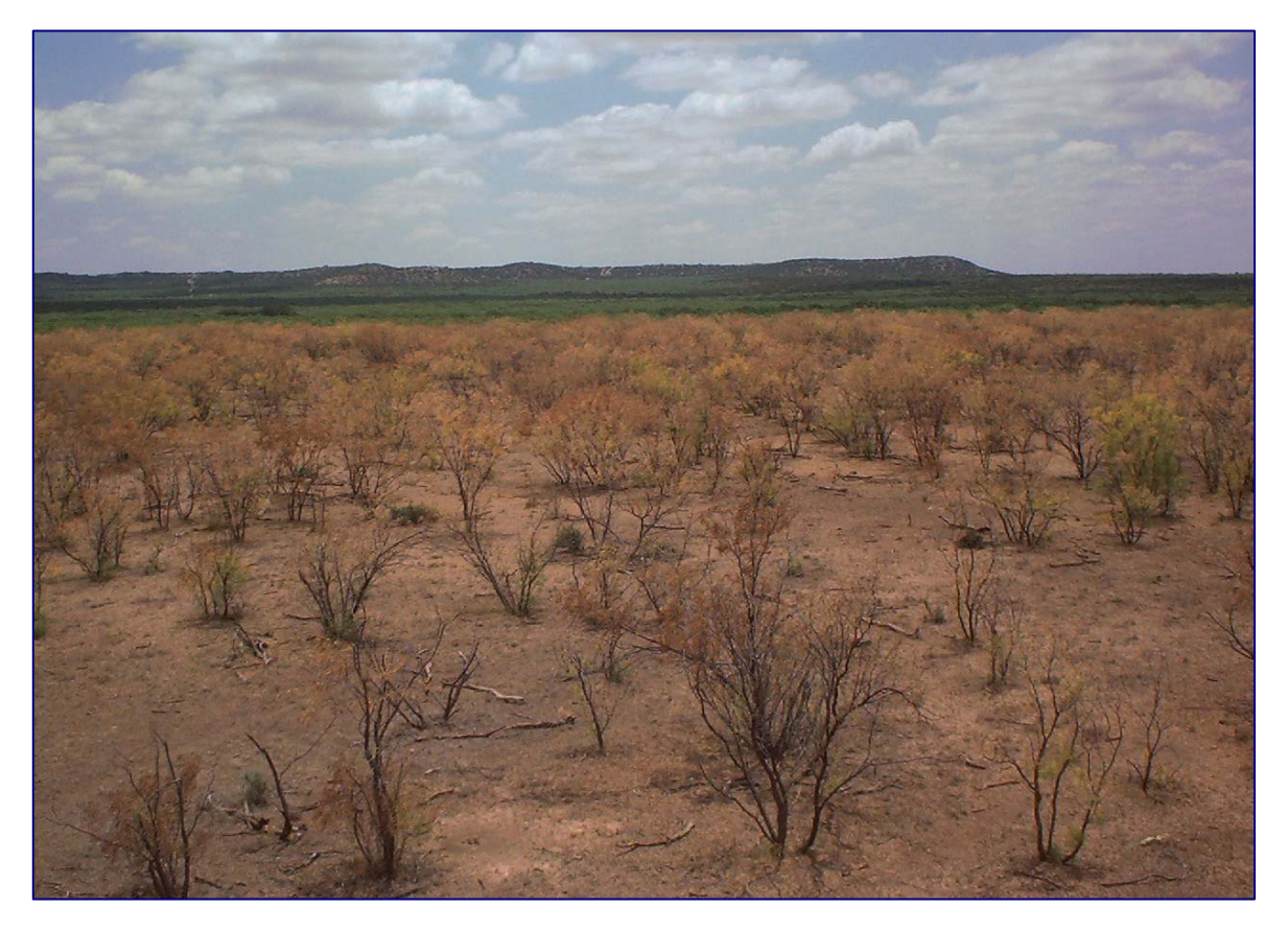
Dead mesquite after brush control

untreated plot. However, the plots were not grazed, and during the subsequent summer, grass and forb growth increased dramatically in the treated plot, and evapotranspiration was only reduced by 7 percent compared with the control. Brush removal in this situation may simply allow more water to be stored in the soil for use by the remaining grasses and forbs. Similar effects were observed by Dugas et al. (1998) in their study of juniper control in the Seco Creek watershed on the Edwards Plateau (see discussion above).